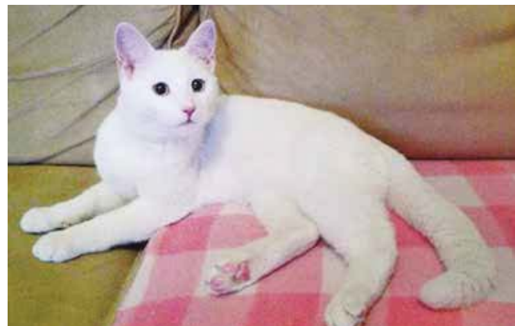
Casper is just a baby kitten who wants to play.

Be kind. Save a life. Support animal rescue. •