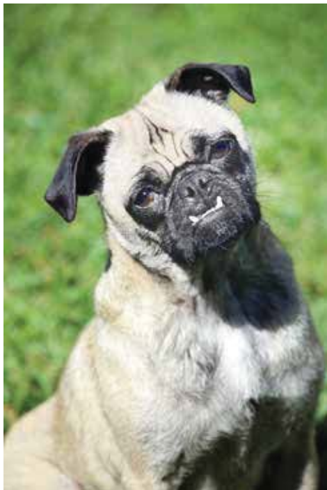
April loves to play and follow her friends around.

April is a sweet year old Pug with the cutest underbite. She is very playful and has a very sweet, loving personality. She is fine with all other dogs and is settling into her foster home well. April crates great at night, not a peep. She loves to chew on her nyla bone and will chase small stuffed toys when you throw them. As most Pugs do, she loves to be with you and will follow you from room