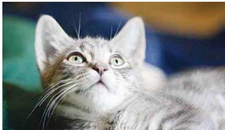
Glitch would love to come home and meet a new playmate.

Glitch’s siblings have all been adopted and now it’s her turn! She is an adorable, affectionate little tabby girl. Let her find her favorite place cuddled up close as possible to you, purring. Glitch is a playful, active