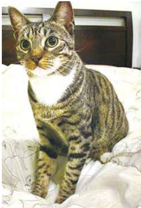
Q loves to be petted and brushed.

“ Q ” is a beautiful brown tabby boy. He and his siblings were abandoned as kittens and he was a little nervous with people when he was rescued. But once he got to know his foster family, Q showed his true colors as the friendly, sweet cat he is. He loves being petted and brushed (and even lint rolled!). Q will show his tummy and ask you for pets and playtime. Active and playful, he loves playing with toys and other cats!