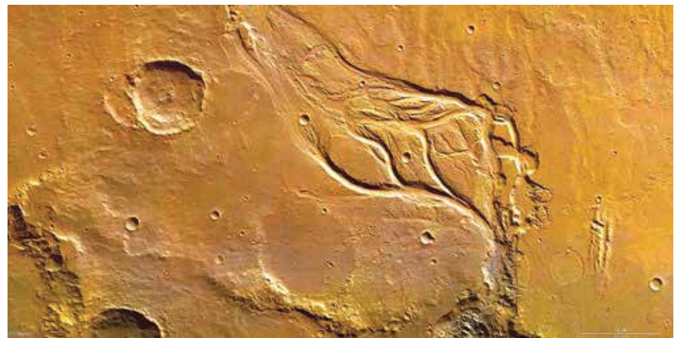
View from space showing Osuga Valles, an outflow channel thought to be eroded by catastrophic flooding on Mars.

Poems submitted to the contest can be in any form, but they should relate in some way to stars, planets, sun, moon, space exploration, or the night sky. Poems should be submitted on the special entry form provided. For the 2014 contest details and a link to the submission form, see: http://astronomerswithoutborders.org/gam2014-programs/astroarts/1467-astro-poetry-contest-for-gam2014.html