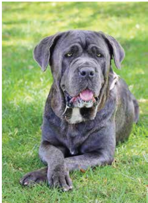
Bisha is so well mannered and needs a low-stress household.

Adopt a “Pet Without a Partner” and Give a Homeless Pet a Second Chance in Life